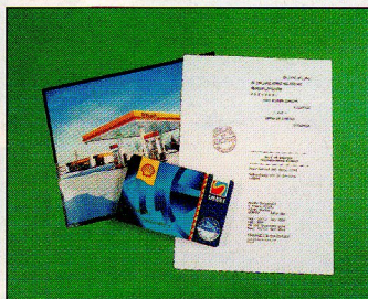
Shell: Disputes Don Marketing writ

Shell's solicitors DJ Freeman also claim in a document written in June 1997 that elements of the Smart idea were public prior to the 1989 meeting with Don Marketing, that they were first developed by Shell as part